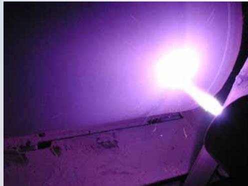
High Purity Coatings