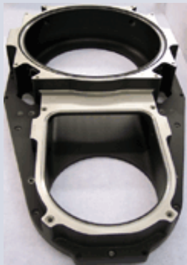
Anodizing & Plating